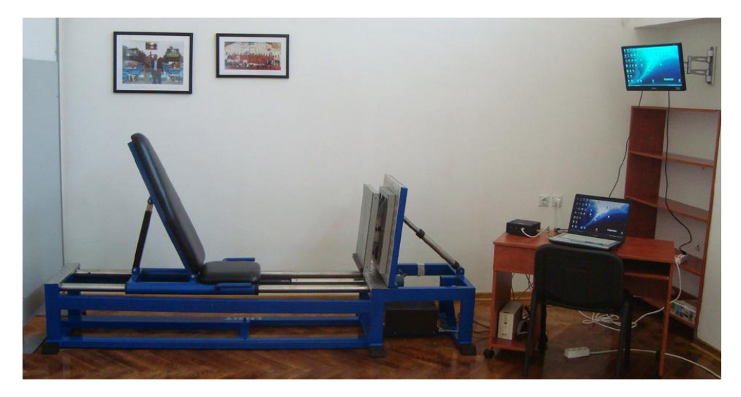
Figure 1. The Measuring Device for Assesing Maximal Leg Extensors Isometric Force